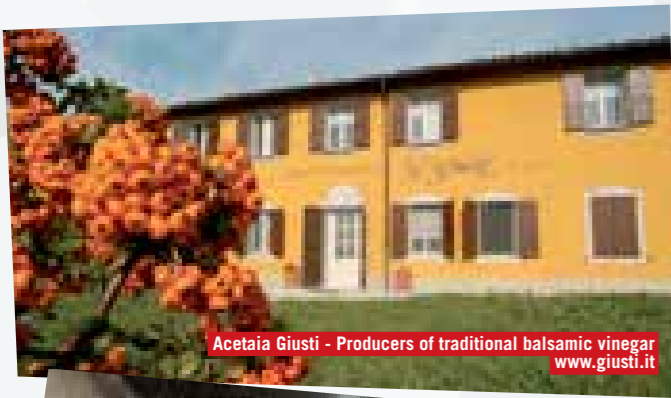
Acetaia Giusti - Producers of traditional balsamic vinegar www.giusti.it