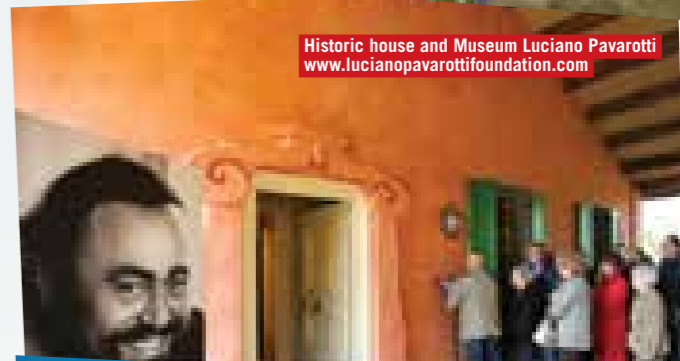
Historic house and Museum Luciano Pavarotti www.lucianopavarottifoundation.com