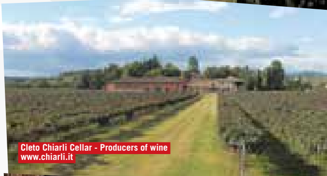
Cleto Chiarli Cellar - Producers of wine www.chiarli.it