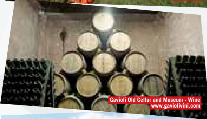
Gavioli Old Cellar and Museum - Wine www.gaviolivini.com