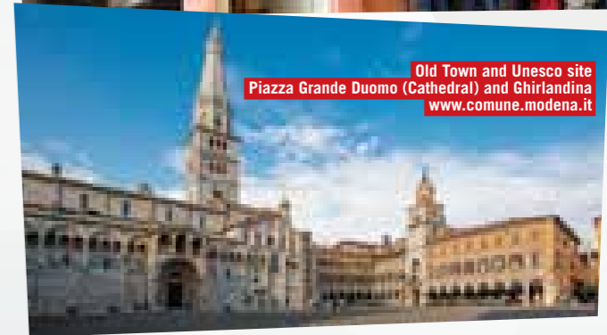
Old Town and Unesco site Piazza Grande Duomo (Cathedral) and Ghirlandina www.comune.modena.it