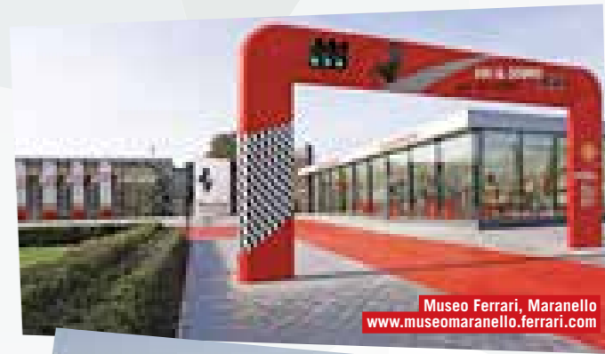
Museo Ferrari, Maranello www.museomaranello.ferrari.com