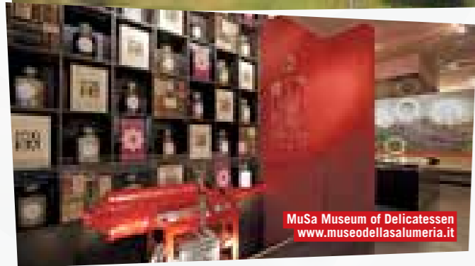
MuSa Museum of Delicatessen www.museodellasalumeria.it