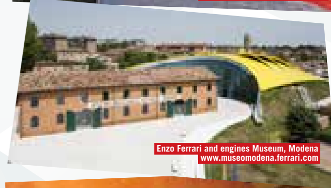
Enzo Ferrari and engines Museum, Modena www.museomodena.ferrari.com